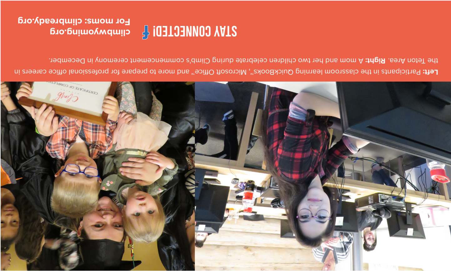
Left: Participants in the classroom learning QuickBooks™, Microsoft Office™ and more to prepare for professional office careers in the Teton Area. Right: A mom and her two children celebrate during Climb's commencement ceremony in December.

LATEST PROGRAM REPORT SEE YOUR IMPACT ON THE LIVES OF SINGLE MOTHERS AND THEIR CHILDREN IN THE TETON AREA!